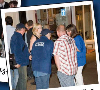
helping build communities