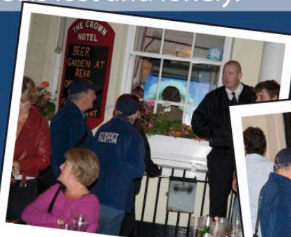
with no strings