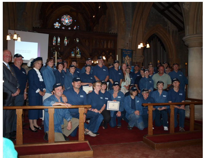
The Street Pastors Team at the Commissioning

As well as commissioning the new recruits 15 volunteers graduated as Street Pastors after a year's excellent service to the community. In total there are now 52 volunteer Street Pastors, and 50 Prayer Pastors supporting them, drawn from over 30 different local churches.