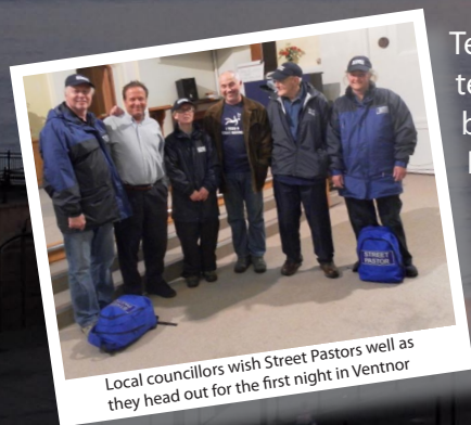
Local councillors wish Street Pastors well as they head out for the first night in Ventnor

In just two years Street Pastors has grown from a scheme only operating in Ryde to regularly covering three Island towns – this growth has only been possible with the support of many dedicated volunteers and generous financial support from individuals and organisations.